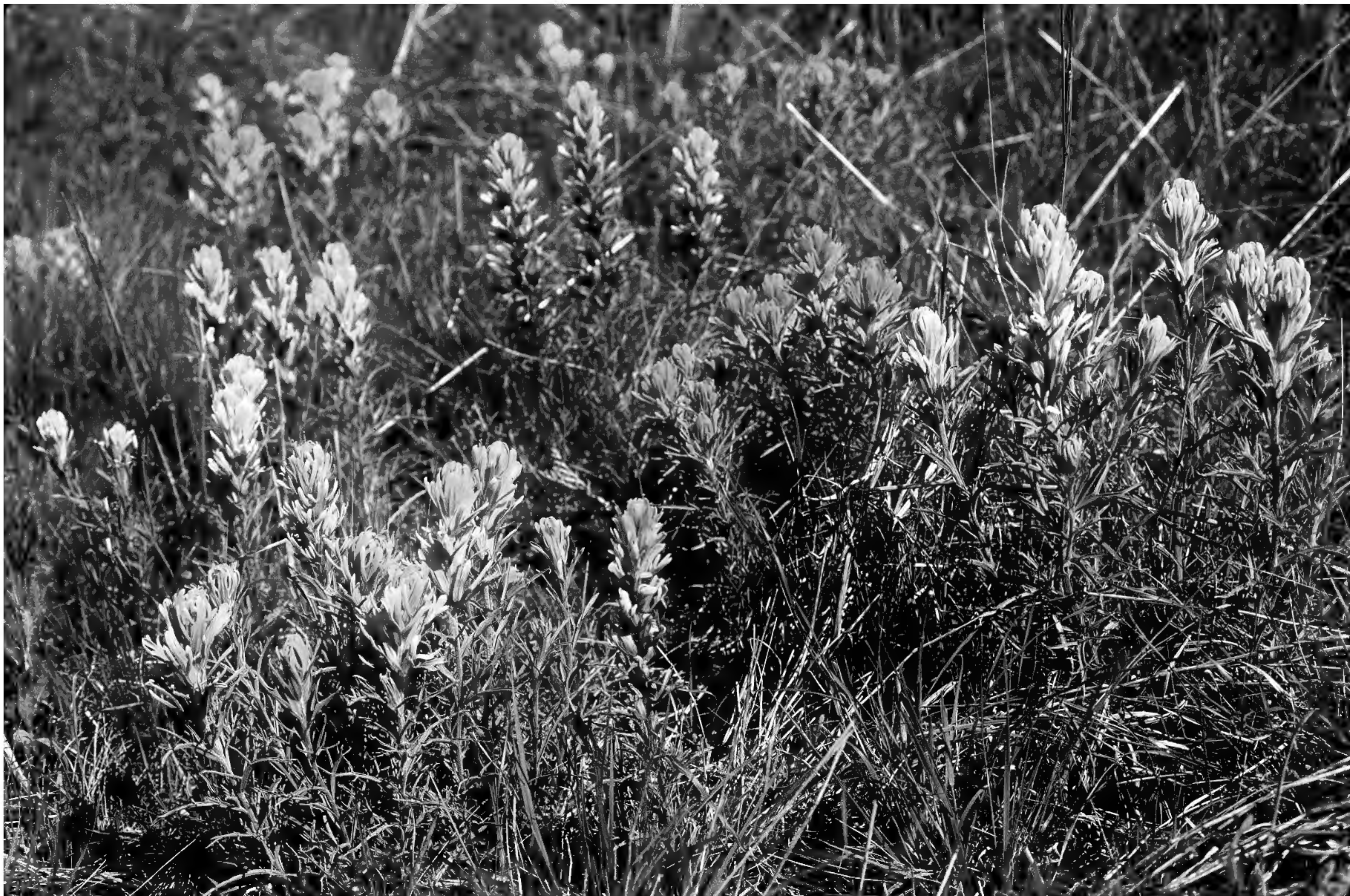
Figure 5. Variable population, including forms apparently intermediate between C. citrina and C. purpurea . Ca. 3 miles east of Talpa, Coleman Co., Texas, 20 Apr 1990. Castilleja citrina in typical form occurs at this site (Fig. 4). Coleman County is slightly northwest of the known range of C. lindheimeri , but the brick red colored plants suggest that its influence also may be showing here.